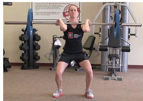
Figure 2. Hang Clean

4) Single-leg RDL: The single-leg RDL is a great posterior chain exercise. Additionally, it targets an important group of stabilizing muscles in the hip known as the external rotators. The external rotators are crucial in maintaining safe and efficient lower extremity mechanics. This exercise also emphasizes a balance element, which will ultimately train greater control when athletes encounter unstable conditions (which they inevitably will playing basketball).